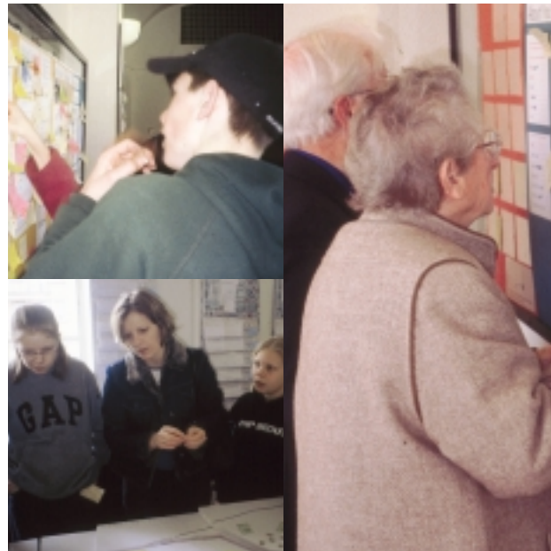
People taking part in the Community Design Days at White Rock Theatre on 22 & 23 February.

The Masterplan will then be revised and considered formally by the Council as a basis for future action.