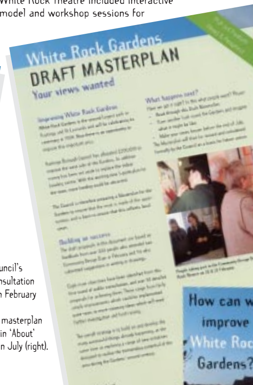
The Council's first consultation leaflet in February (left) and draft masterplan published in 'About' magazine in July (right).