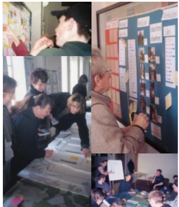
Community Design Days at White Rock Theatre included interactive displays, a 'design for real' model and workshop sessions for special interest groups.

This Masterplan will now be used to guide the improvement programme. The next step will be to undertake detailed feasibility and design work on the proposals and then draw up an implementation programme.