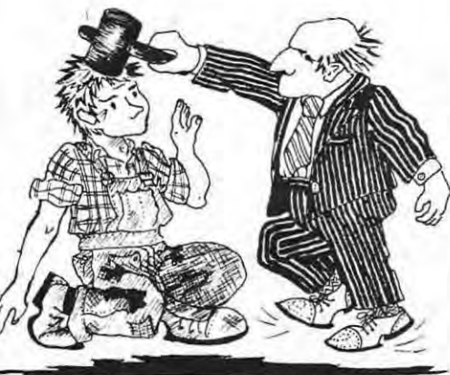
"Participation" in Tower Hamlets

WHERE WILL PEOPLE GO? WILL IT BE IN THIS AREA? WILL IT BE ANY BETTER? WHAT WILL THE RENTS BE? The planners don't seem to care whether people WANT to be forced out of Limehouse.